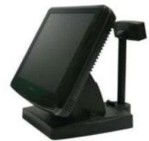
PD2602 Customer Pole Displays