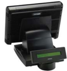
PD305B Customer Display