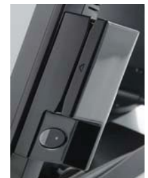
MSR w/ DigitalPersona Fingerprint Biometrics