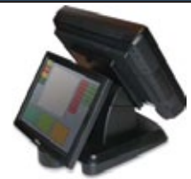
Leverage digital signage opportunities w/the LM6000 Secondary Display